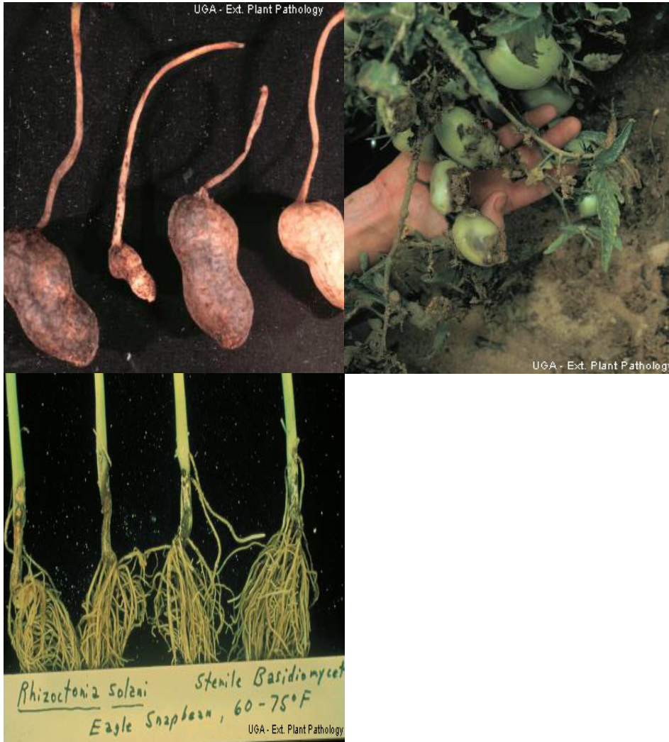
UGA - Ext. Plant Pathology

Rhizoctonia is the most important pathogen worldwide. It causes a variety of different disease including damping-off. Seedling stem canker ("soreshin"), tuber and root rots, leaf blight and rots on vegetables and fruit.